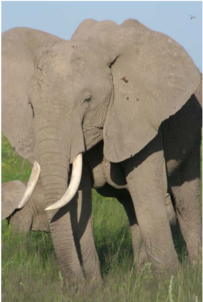
Keep on Truckin’!

Finally, check out the additional resources section and visit the recommended websites on a regular basis to stay update to date on green market trends to best position your wildlife friendly products.