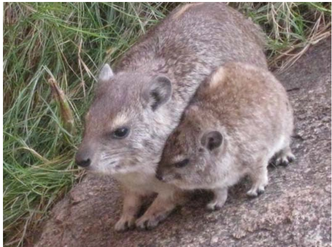
Hey Mom, can we be early adopters?

But, how do you identify and harness these early adopter consumers for your products and wildlife conservation story? Identify repeat purchasers and ask for feedback on your products to identify consumers who feel passionate about your products and work. Offer a “refer a friend” promotion to actively enlist your early adopters to spread the word.