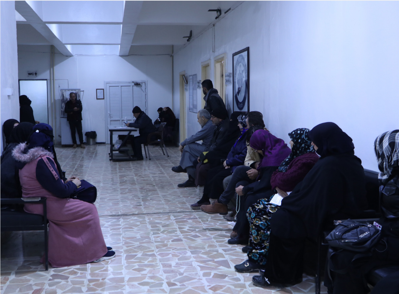
Waiting room at SAMS-run Idlib oncology center.

This further confirms that efforts and resources must be invested in establishing post-treatment care systems that would keep a record of a patient’s health and treatment history, and have automated notifications in place when the time would come for a follow-up examination. This would give a possibility for medical staff to reach out to patients directly and offer options for further care .