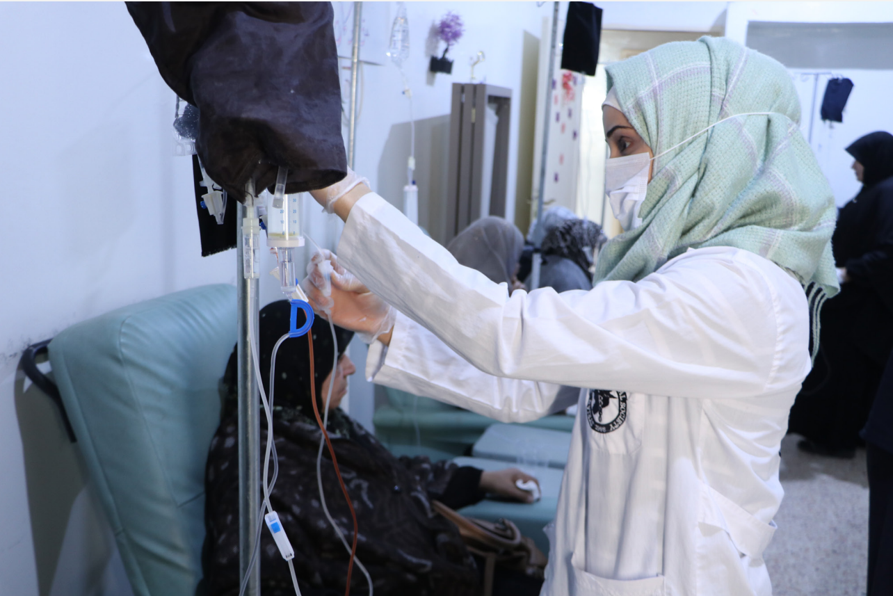
A nurse checking on the progress of chemotherapy at the SAMS-run Idlib oncology center.

Getting comprehensive information about available services for breast cancer is a cumbersome exercise. The NWS Health Cluster led by the World Health Organisation conducts service-mapping on a quarterly basis, however hospitals frequently declare that specific services are provided, while in reality they only partially exist . For example, some NGO-run hospitals declare availability of chemotherapy in their premises, however donor-funded projects do not include these medications in their standard kits for health. Instead, medical staff who can administer chemotherapy under the supervision of a doctor are available, but only if the patients themselves purchase the medications privately . Specific NGO-funded hospitals are mentioned as service providers in different stages of breast cancer screening and treatment cycle, while only one partner in NWS provides comprehensive services .