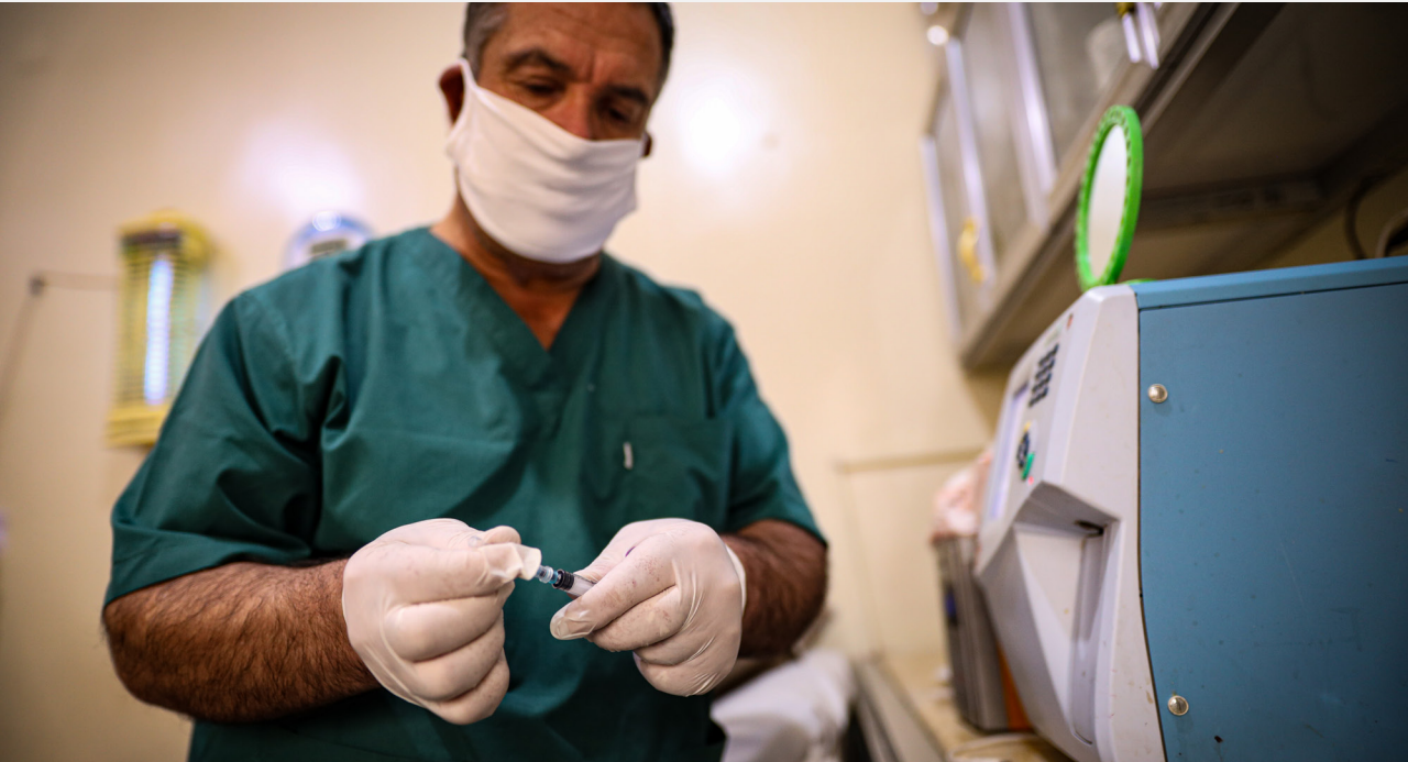
Medical professional performing a blood test at RI-run Nour hospital in Idlib.

The general laboratory testing during the treatment course (routine blood count and differential, blood chemistry, coagulation factors, etc.) is however not usually supported by NGOs , it would therefore require patients to go to private laboratories, with a fee that could vary from 20 to 100 USD per test, depending on whether the doctor has requested to perform also some additional tumour marker tests or not, making the testing unaffordable for many in an area where 97% of the population lives below the poverty line .