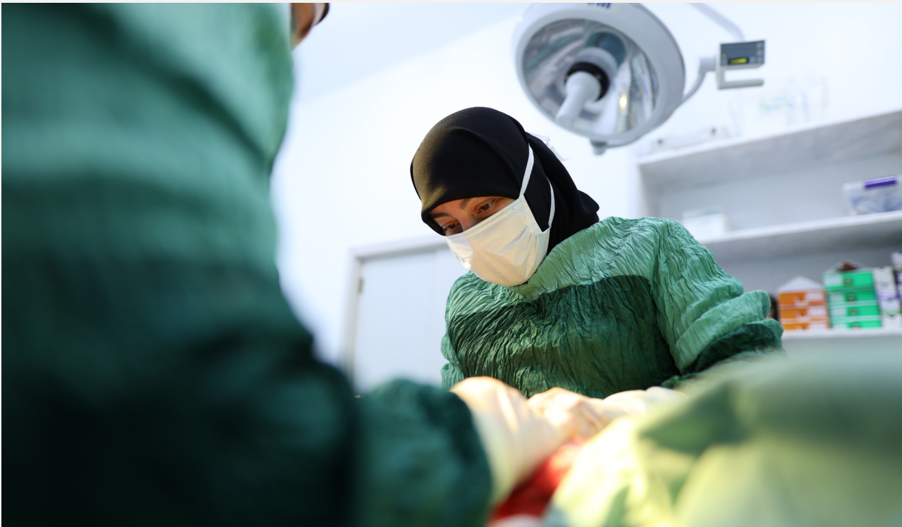
Doctors and nurses in surgery at surgery at RI-run maternity ward at Nour hospital in Idlib.

In an April 2022 survey conducted by Relief International in Idlib and Aleppo governorates, roughly half of interviewed women (49%) were not aware that they can do an initial self-examination of their breasts to check for nodes. Furthermore, among the surveyed women, 65% did not know where to go for a mammography screening should they need to. Less than half of women (40%) said that they received awareness sessions on breast cancer or availability of specialised services , making an early detection of breast cancer less likely.