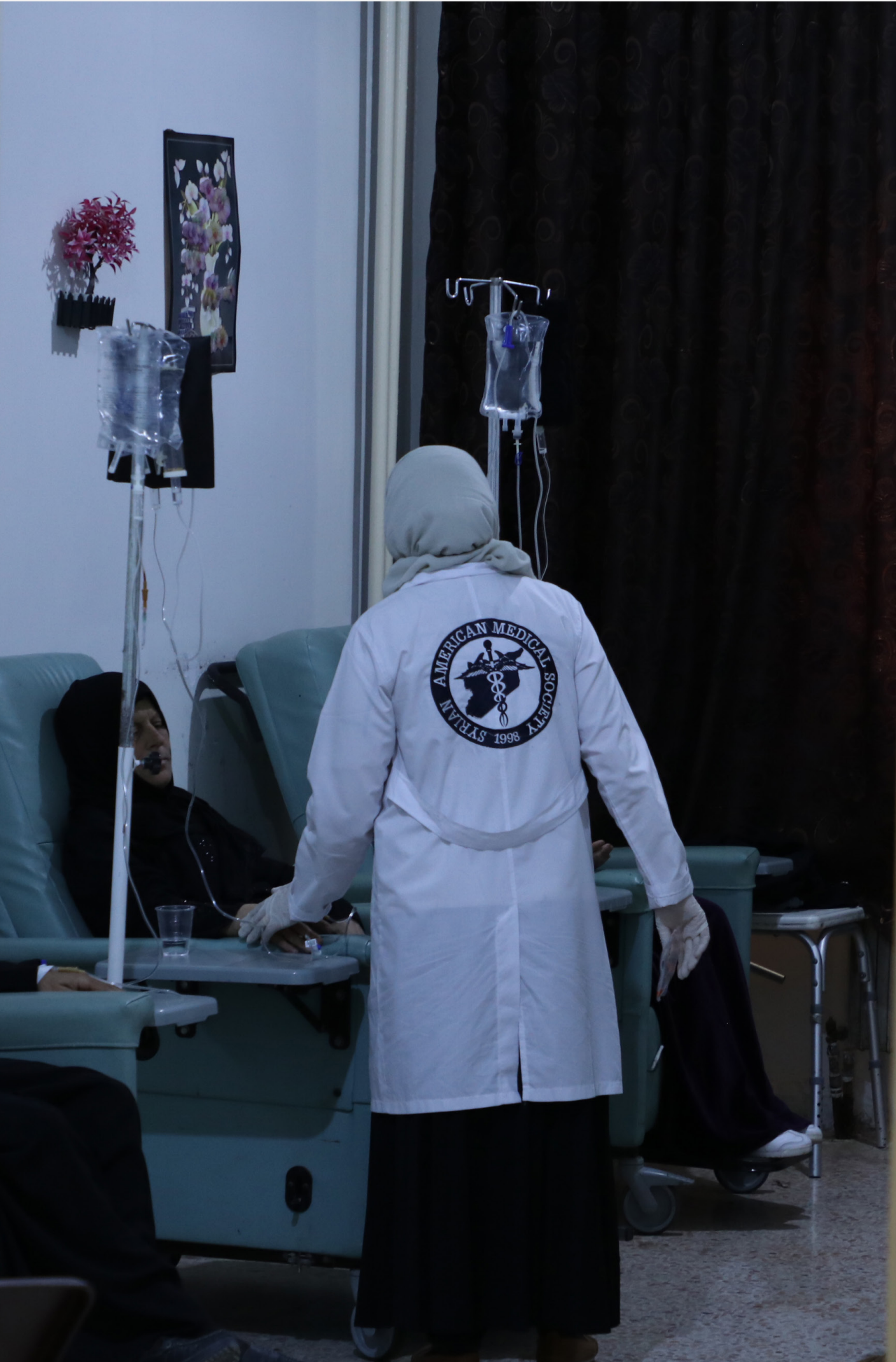
A nurse checking on a patient undergoing chemotherapy.