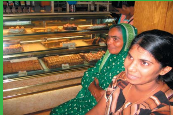
RI trained six Sri-Lankan women in all aspects of bakery operations as part of a pilot microfinance project in December 2005

RI's Rural Savings Creation Project (RSCP) provides microfinance services for tsunami-affected families on the east coast of Sri Lanka. RSCP particularly targets women, forming 61 Community-Based Organizations in 2005 that allowed 1,615 Sri Lankan women access to alternative livelihoods training and loans. Each CBO elects officers who receive training in group leadership, records-keeping and basic microfinance operations. Women's groups have saved $14,522 to date and achieved a remarkable repayment rate of 100 percent.