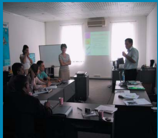
Relief Iraq staff receive training in NGO operations in 2005

In Iraq, the legacy of Saddam Hussein's regime is an almost complete absence of non-political civil society with the capacity to implement projects that meet the needs of Iraqis. In an effort to build NGO capacity in Iraq, Relief Iraq (RIq) was founded in 2005 as a local counterpart to Relief International. Over the next five years, Relief Iraq will transition from a model in which RI is primarily responsible for the design and implementation of programs, fundraising and accountability to a wholly independent organization that has its own active board, trained staff and the capacity to develop and secure resources for its own programs. Relief Iraq is currently recruiting and developing new projects in the areas of livelihoods restoration, returnee monitoring and protection, and the development of new grassroots institutions.