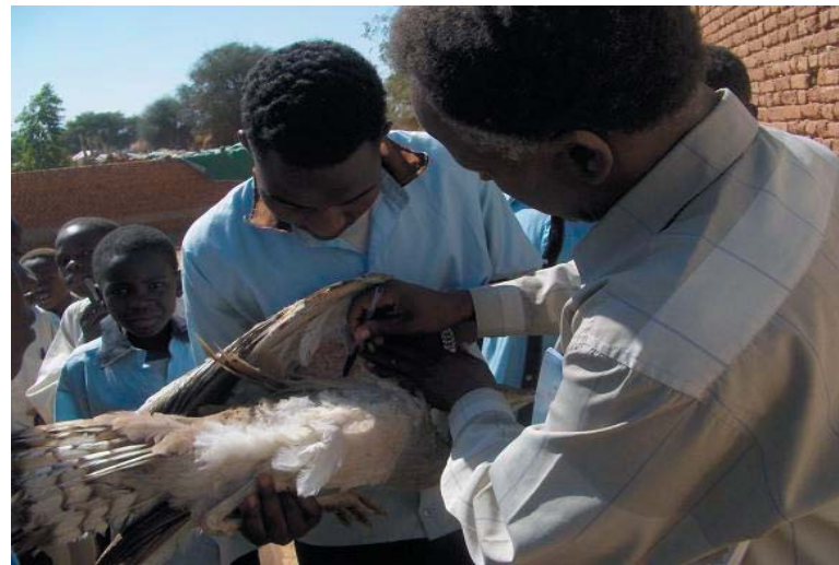
Chickens being cared for at an Animal Treatment Center in Kabkabiya

In March 2005, RI established a small-enterprise support program in Darfur. Business trainings held in the towns of Saraf Umra and Kabkabiya in North Darfur served more than 900 beneficiaries, with microcredit loans disbursed to 20 groups and 27