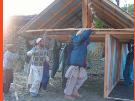
Residents of Hilkot Village build a shelter

More than 98 percent of families lost their homes in the devastated villages of Bhogarmong and Hilkot in the Mansehra District. In Hilkot village, RI -SOL began constructing more than 170 transitional homes for families, designed to provide adequate shelter to survive the first winters after the quake. In Bhogarmong, RI-SOL launched a pilot project to construct 25 permanent shelters using an innovative panel technology that can withstand earthquakes of up to 8.0 on the Richter scale. These shelters have proven a practical, affordable and time-efficient alternative to conventional construction methods – each home takes one week to construct.