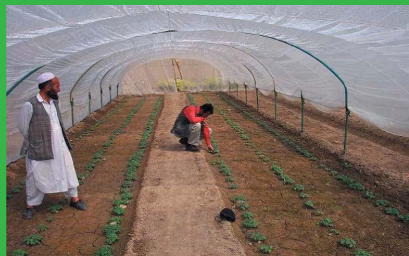
Afghan farmers plant high value vegetables in a newly constructed greenhouse through RI's alternative livelihoods program

The program also has an educational component in which farmers receive training in modern farming techniques and members of the agriculture faculty of Nangarhar University receive training in project design, implementation and data collection. A total of 78 farmers and 12 faculty members were trained in 2005, and twenty-five farms were involved in trials for this program. All of these farms have subsequently stopped poppy growing.