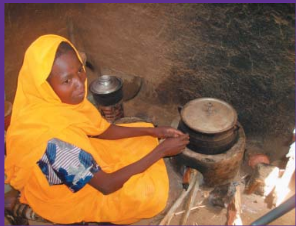
A Sudanese woman in Darfur operates a fuel-efficient stove indoors

Starting in September 2005, the Women's Development team and the Protection team at RI Sudan have held workshops that teach women how to build fuel-efficient stoves that burn more cleanly and require less wood, reducing the impact of smoke inhalation and the need for dangerous travel. In its first year, the stoves project trained an average of 50 women each week.