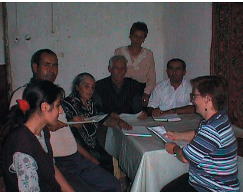
A community council meeting in Azerbaijan. Community members receive training in all aspects of small business operations as part of RI's MADAD credit program

RI's microcredit program stimulates economic development and provides livelihoods for the poor through the provision of agricultural credits, livestock revolving funds and microcredit enterprise expansion in a relief and transitional development setting. The microcredit program distributes loans to Internally Displaced Persons (IDPs) and other conflict-affected populations through a local NGO partner, MADAD, to initiate small enterprises in market gardening, bee keeping, animal husbandry, agricultural training and marketing methods. Cooperatives of five to eight members, called