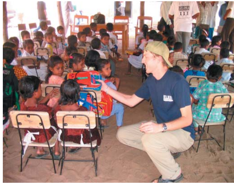
An American exchange student meets with children at a Sri Lankan elementary school

In southern Sri Lanka, the American students came face-to-face with their Sri Lankan GCEP counterparts – several youth leaders from an indigenous NGO, the Center for Peace Building and Reconciliation. Together, 10 Americans and 30 Sri Lankan youth worked to conduct a needs assessments of the community and collaborate on joint projects. The US students also experienced home-stays with the Sinhalese youth, which enabled them to learn about Sri Lankan family life first hand. The GCYP Tsunami Relief Youth Exchange was made possible through private donations pledged by RI Board Member Kitty Dukakis and the Annenberg Foundation.