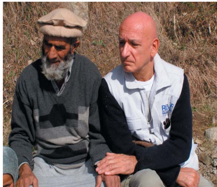
Sir Ben Kingsley traveled to Pakistan with RI to visit survivors after the earthquake

RI has made an ongoing commitment to help ensure the continuing development of villages damaged by the earthquake, and has instituted a number of programs designed to restore the self-reliance, independence and vitality of these communities. Within weeks of the quake, RI instituted an Adopt-A-Village program to raise funds to reconstruct damaged infrastructure in small villages, including housing, schools, medical clinics, libraries and sanitation facilities. RI has also initiated animal restocking and micro-credit loan programs for earthquake survivors, providing access to economic resources necessary for survivors to regain financial self-reliance. These programs will continue through 2006.