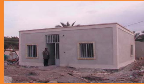
An Iranian man stands in front of his new home, completed in March 2005

RI was one of the first NGOs to respond to the devastating December 26, 2003 earthquake in Bam, Iran. RI continued its rehabilitation and community development activities in Bam in 2005, long after most other international aid organizations had withdrawn from the area. In total, RI has constructed 840 permanent houses, two medical clinics, two schools, and two community centers for residents of the severely-damaged villages of Poshtrood and Espchikan. RI has also established a microcredit program to provide earthquake victims with small loans for the purchase of livestock, sewing equipment, and the establishment and renovation of small businesses